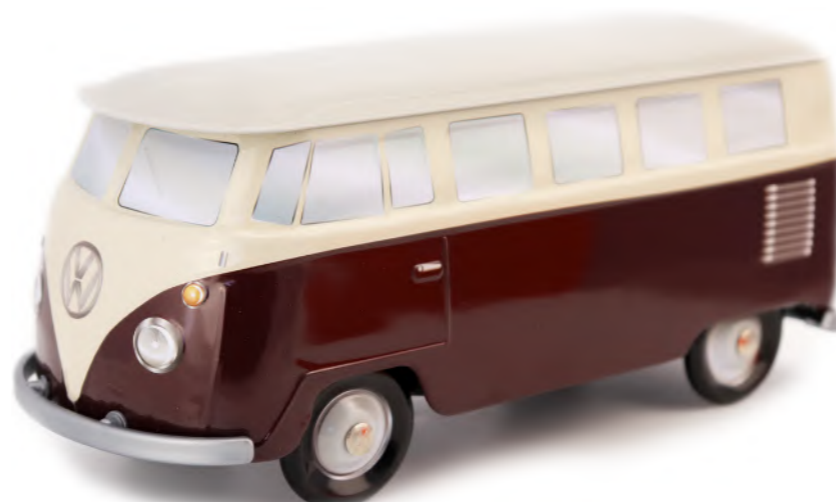
BEIGE & BROWN