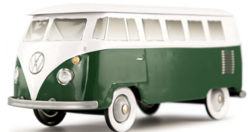
WHITE & GREEN