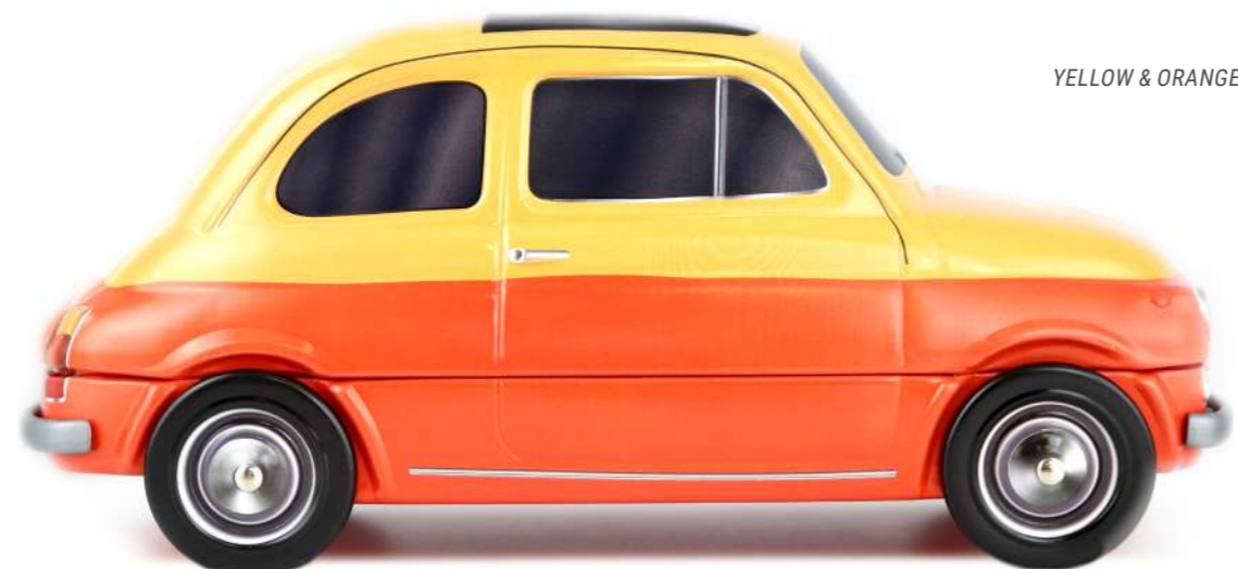
YELLOW & ORANGE