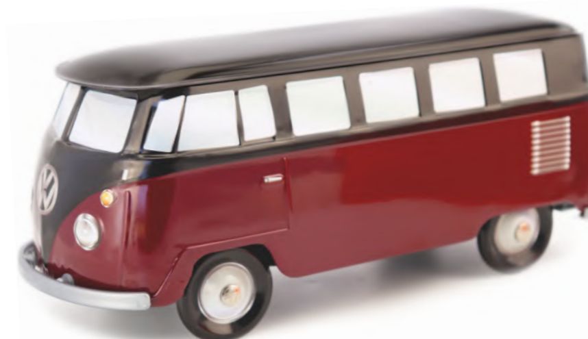
BLACK & DARK RED