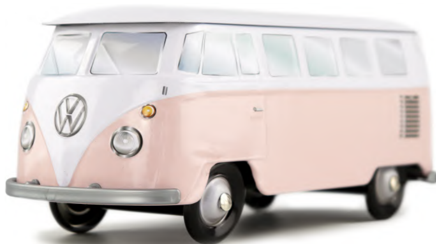
WHITE & PALE PINK