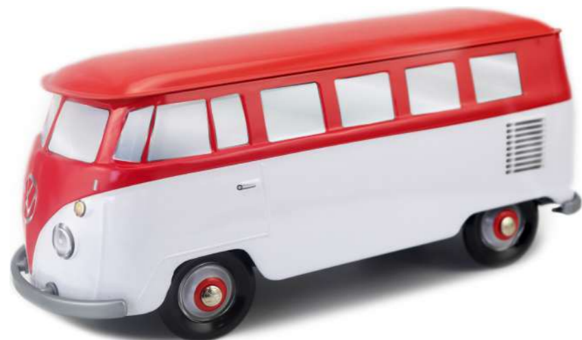
RED & WHITE