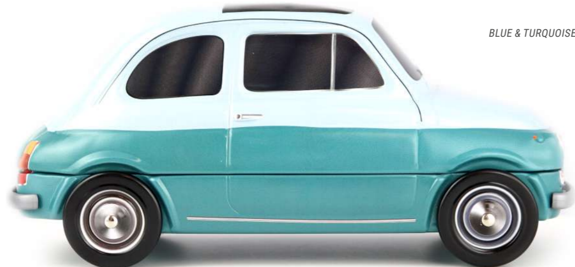
BLUE & TURQUOISE