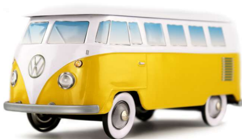
WHITE & YELLOW