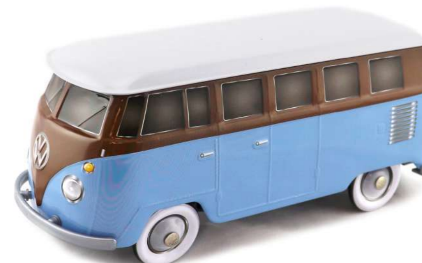
BROWN & BLUE