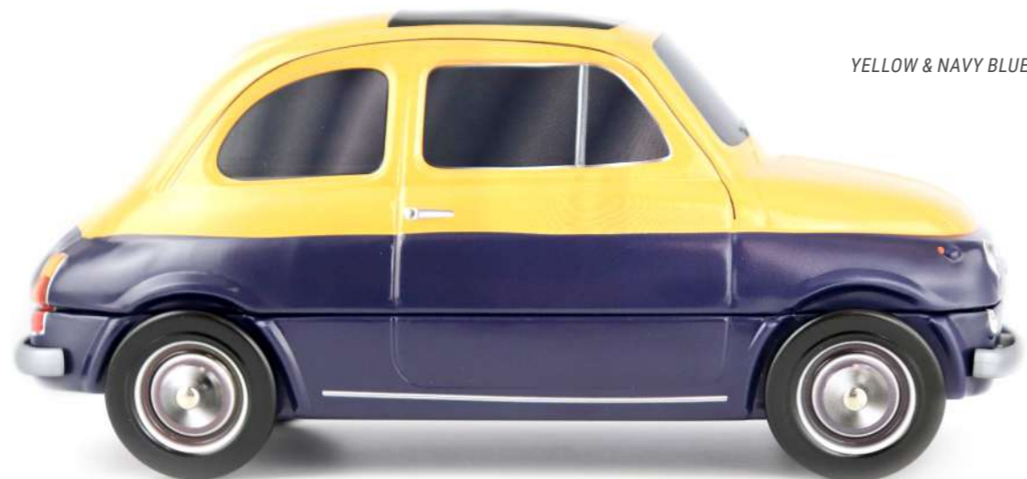
YELLOW & NAVY BLUE