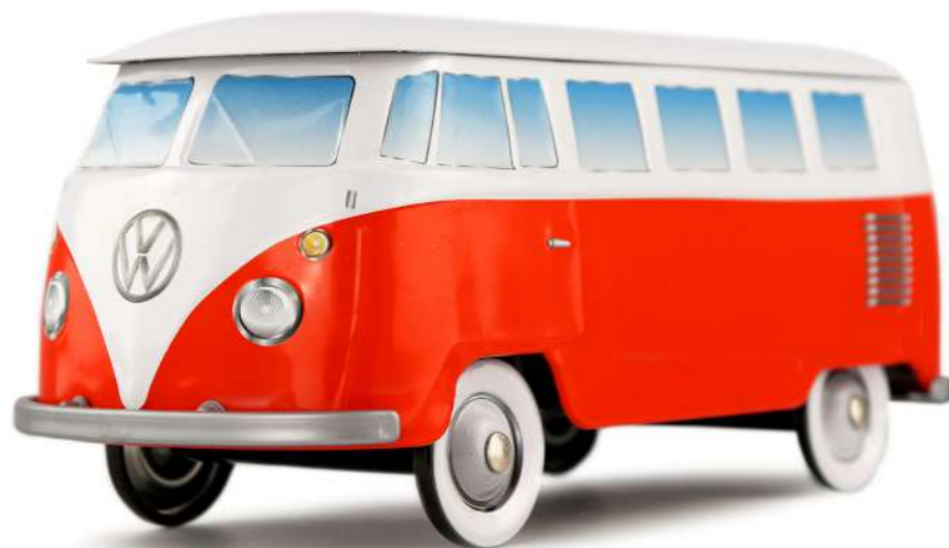
WHITE & RED