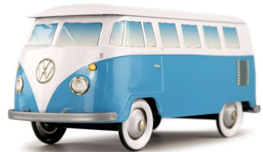
WHITE & BLUE