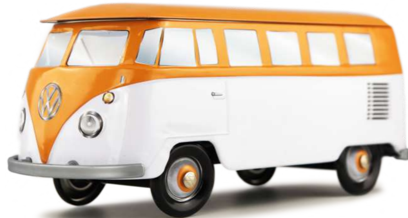
ORANGE & WHITE