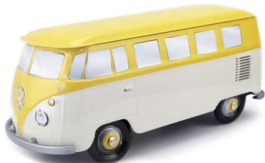
YELLOW & BEIGE