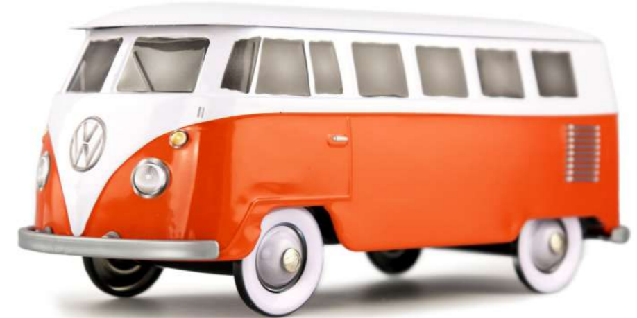
WHITE & ORANGE