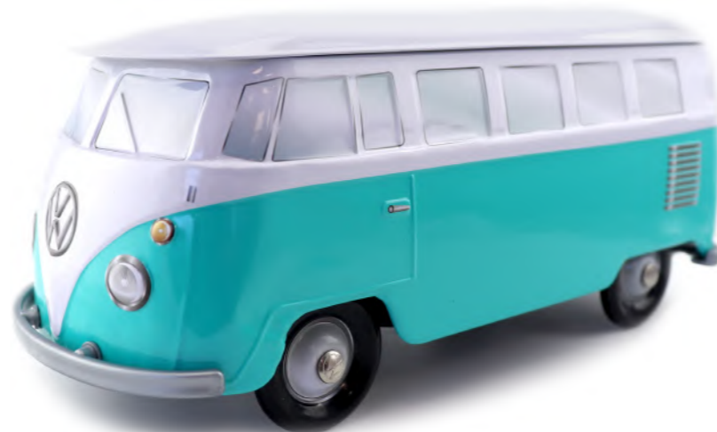
WHITE & TURQUOISE