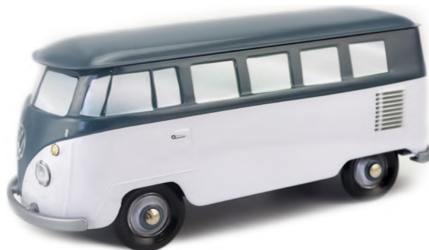
STEEL BLUE & WHITE