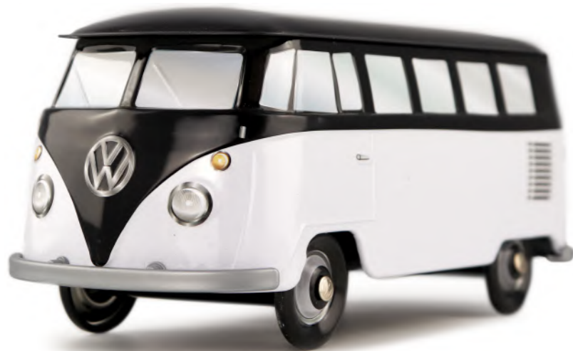
BLACK & WHITE