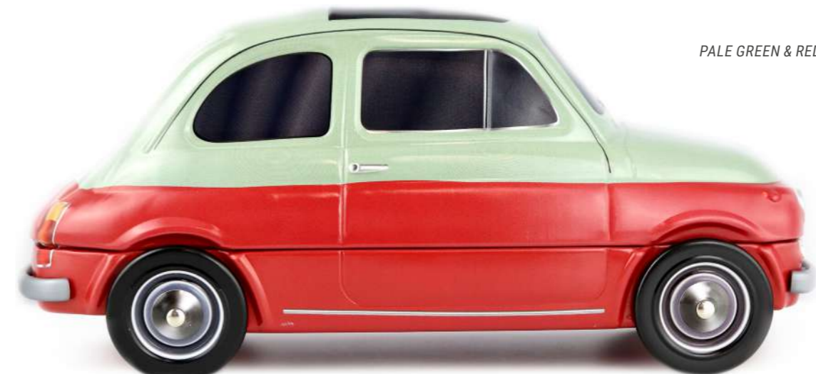
PALE GREEN & RED