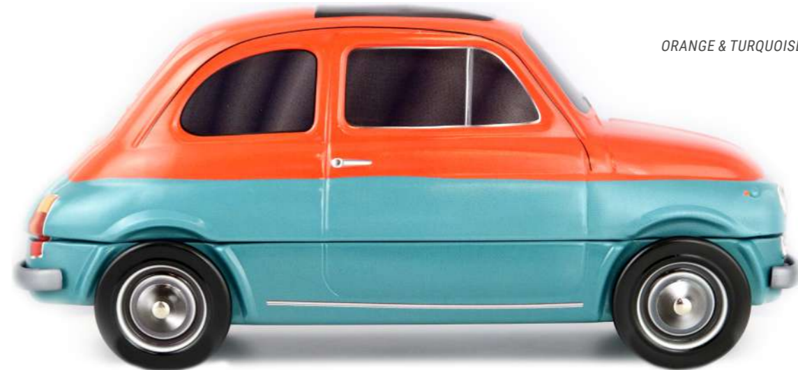
ORANGE & TURQUOISE