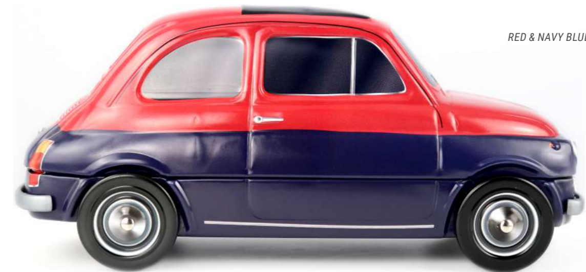
RED & NAVY BLUE