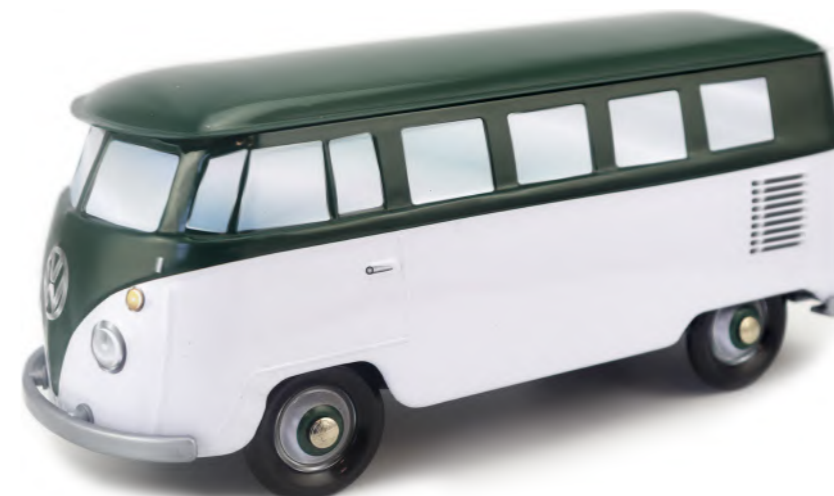
GREEN & WHITE