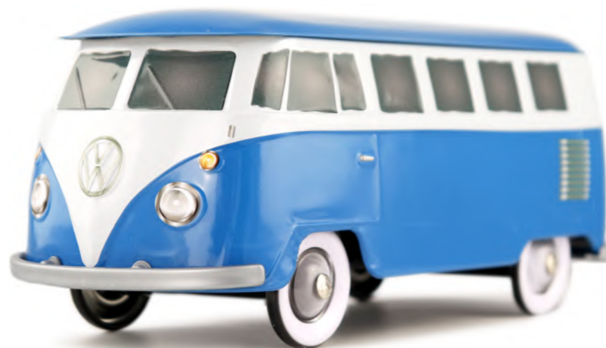
WHITE & NAVY BLUE